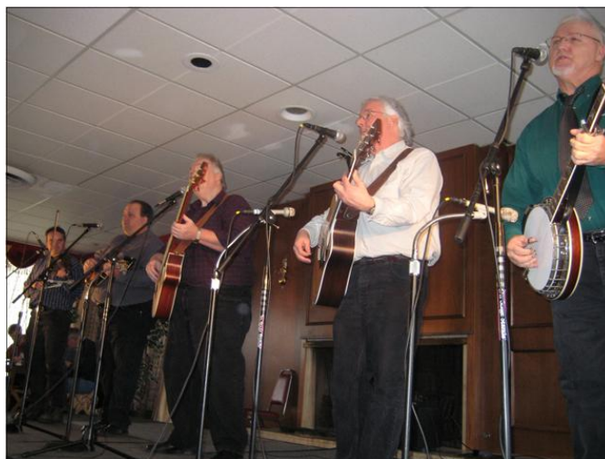
The grand prize winning Church Street Blues band singing "Black Bubblin' Crude."

The New Generation String Band , a group where the old music meets young musicians, featured a story based on a child's wonderment at an oil sheen rainbow in a puddle of water. "Look daddy, a rainbow fell out of the sky!" "Rainbows on the Water"...Oil through the eyes of a child.